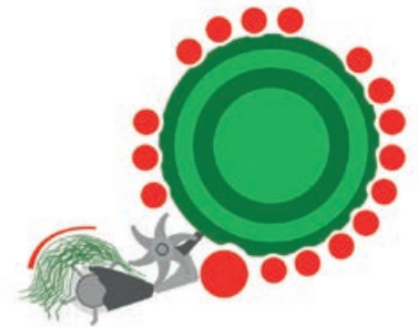
16-cylinder pressing chamber